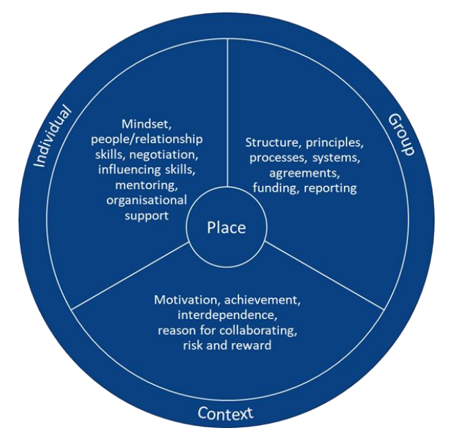
Sustaining collaborative governance: key ingredients

While there has been substantial focus on establishing collaborative governance arrangements (who should be involved? what structures and funding are required? and so on), there has been less focus on the key ingredients to sustaining collaborative governance over time. There are three key aspects associated with sustaining collaborative governance, and all three work together to facilitate effective ongoing collaborations.