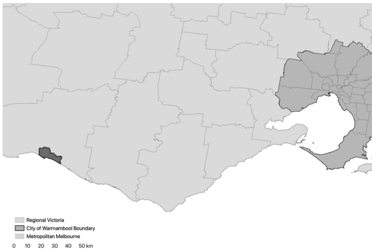
Proximity to Melbourne metropolitan area

The platform to be developed should be capable of recording Council and community actions towards reducing the impact of climate change.