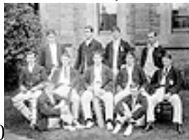
Record ID UMA/I/1300