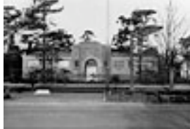
Record ID UMA/I/1888

Title: Percy Grainger Museum, University of Melbourne, circa 1935.