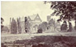
Record ID UMA/I/1060