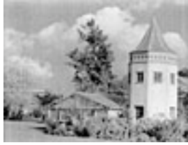
Record ID UMA/I/1819

29. Land and Environment Building. Originally the School of Agriculture.