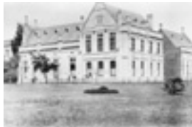
Record ID UMA/I/2090

Title: Natural Philosophy School buildings, University of Melbourne, 1892.