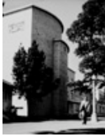
Record ID UMA/I/2034

33. Baillieu Library. The largest library on campus, houses the main arts, humanities and social sciences collections as well as undergraduate material for physics and mathematics. It also houses the Louise Hanson-Dyer Music Library, East Asian Collection, and the Special Collections which include rare books and manuscripts. The bookshop sells publications from Melbourne University Publishing, one of the few university presses remaining in Australia, as well as general academic books and supplies.