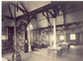
Record ID UMA/I/1007

Title: Interior of old Central Library, University of Melbourne, circa 1901.