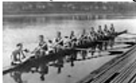
Record ID UMA/I/1626