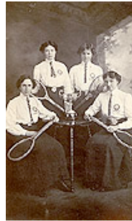
Title: Women's tennis team, University of Melbourne. Record ID UMA/I/1206

The Bureaurepaire Centre is the result of a generous donation from former Olympic swimming champion Sir Frank Beaurepaire. It also served as a training facility for the 1956 Olympic games, in which the University had a major administrative role to play. A colourful mural by Leonard French graces the foyer. Beyond are the sports oval, running track and colleges. The University has a long and proud tradition of sports.