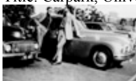
Record ID UMA/I/2153

Title: Carpark, University of Melbourne, September 1952.