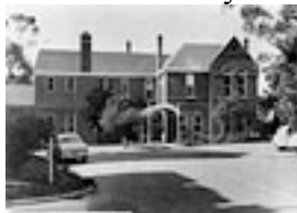
Record ID UMA/I/1614

Title: University House Extensions, University of Melbourne, 8 February 1956.