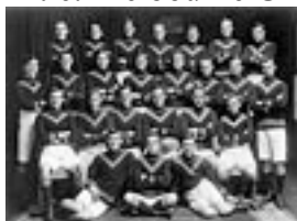
Record ID UMA/I/1669