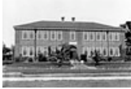
Record ID UMA/I/1885

Title: School of Agriculture, University of Melbourne, circa 1930.