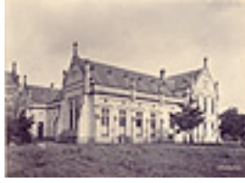
Record ID UMA/I/1008