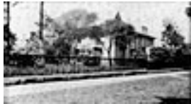
Record ID UMA/I/1705

Title Conservatorium, University of Melbourne, 1921-1926.