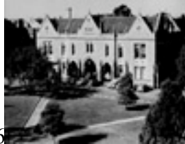
Record ID UMA/I/2036