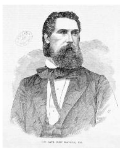
Figure 1. John Macadam.

In the November edition (p. 20), I provided an overview of the Chemistry Collection at the University of Melbourne, its significance and various projects I have been involved with that aim to make the collection available to the public. I hinted at how many of the items in the collection are associated with key figures in the history of chemistry and science not only at the University of Melbourne but also on national and international levels. These early teachers of chemistry are featured in an inaugural exhibition in the foyer of the Chemistry Building. Here I will focus on the early days, when chemistry was taught through the Medical School and the two main chemistry lecturers of this time: Macadam and Kirkland.