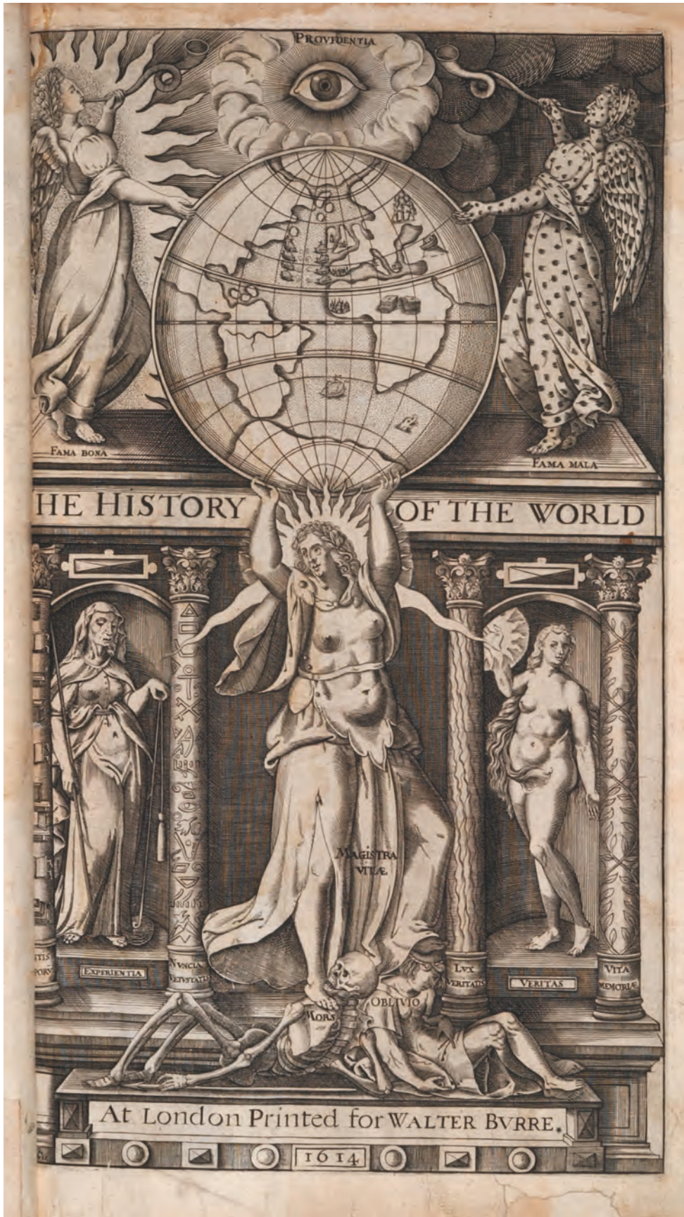
Title page of Sir Walter Raleigh, History of the World, London, Printed for Walter Burre, 1614. From the George McArthur Bequest, 1903.