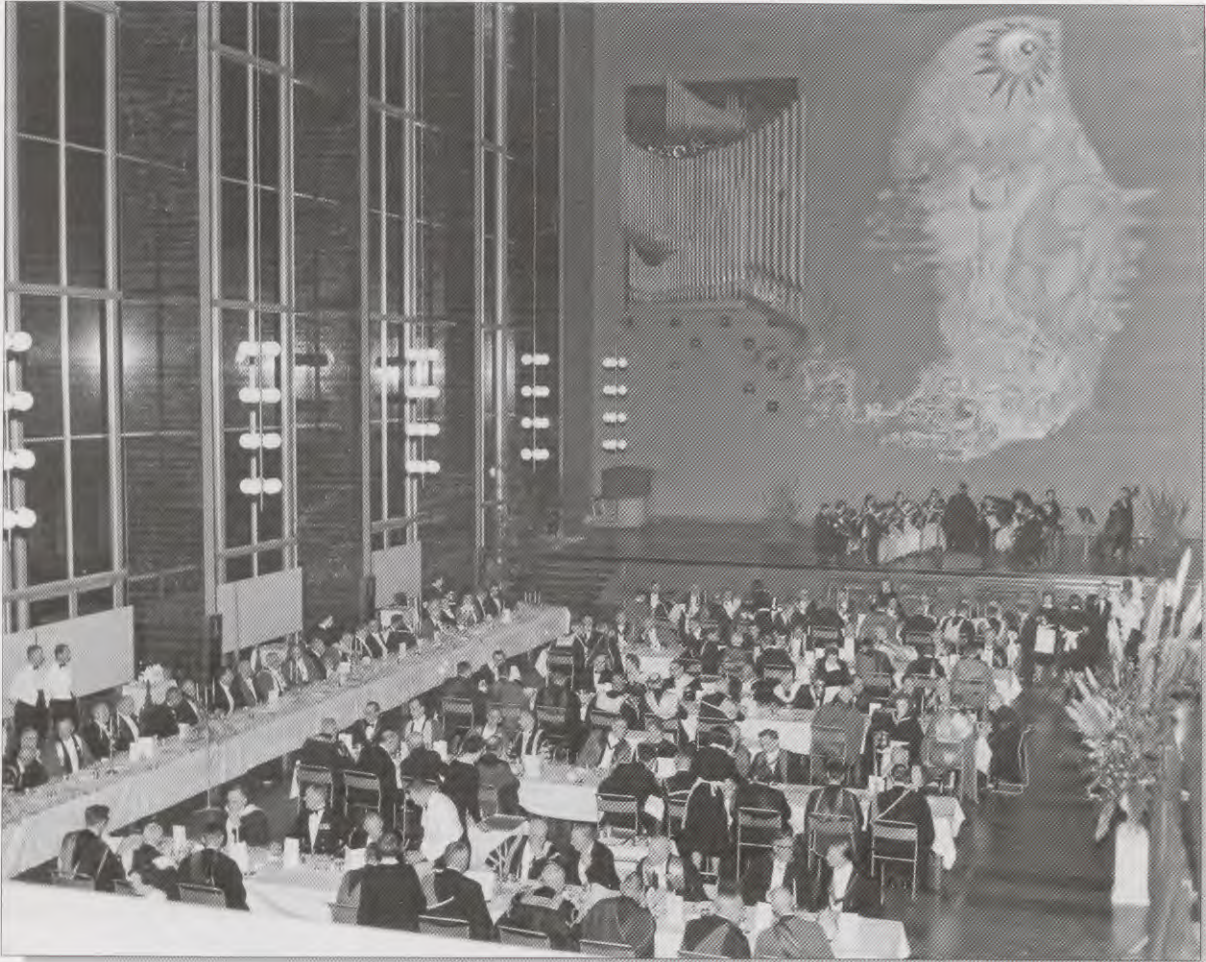
Centenary banquet in Wilson Hall, August 1956: view from the balcony, showing guests at tables and an orchestra playing on the stage.