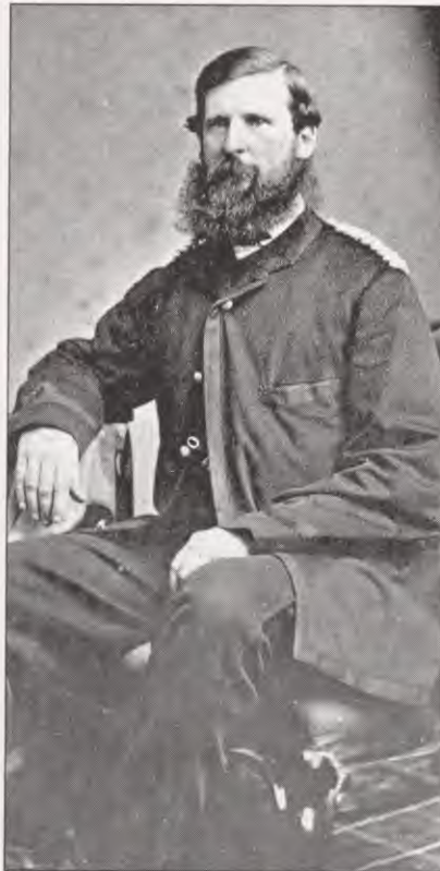
Superintendent Francis Hare, shot in the wrist by Ned Kelly at Glenrowan, 28 June, 1880.