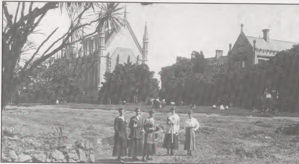
"A Scene of Desolation"