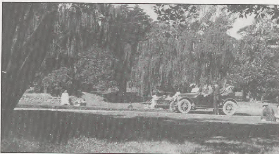
"In Stew Vac"