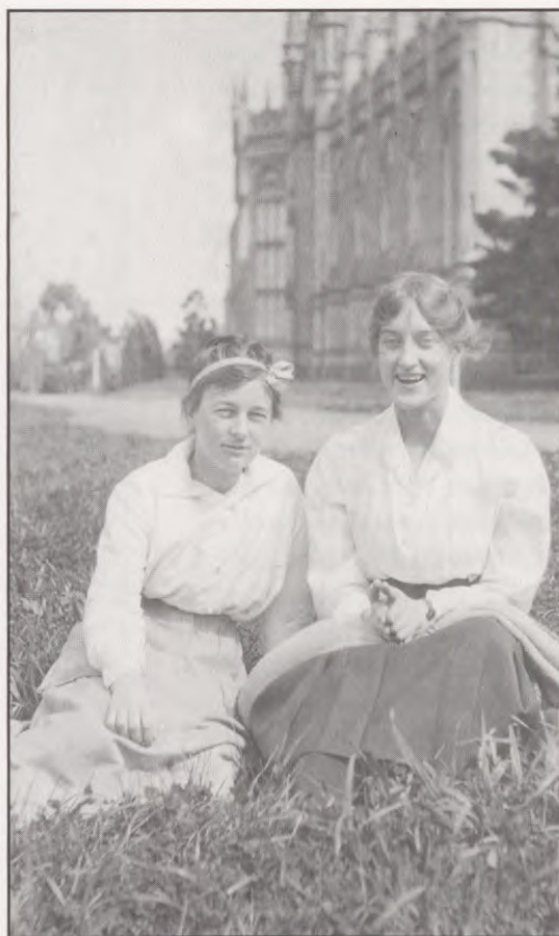
..... "We Two!"