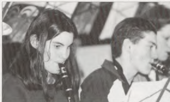
Live music in the foyers was a feature of Library Week 1995